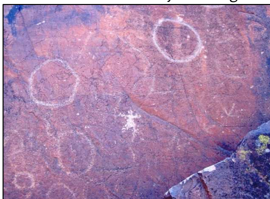
40,000 year-old Aboriginal Carvings Sacred Canyon, South Australia

carvings (see photo) suddenly appeared in several concentric circles. The purpose of my full circle journey was being revealed – I had come to Australia two years ago to heal, and my healing was complete. Like Dorothy in the Wizard of Oz, it was my time to go home.