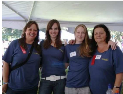
September '08, New Dawn was present at the Statewide Recovery Happens at the California Capital

Last month, New Dawn helped sponsor Mercy's "I've Got You Babe" dinner held in support of the